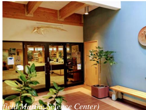
Guin Library