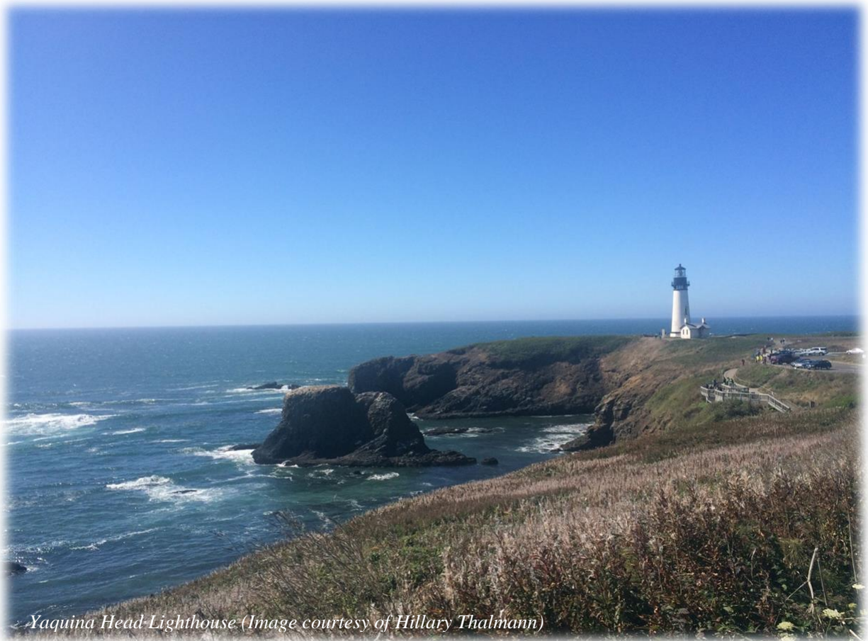
Yaquina Head Lighthouse