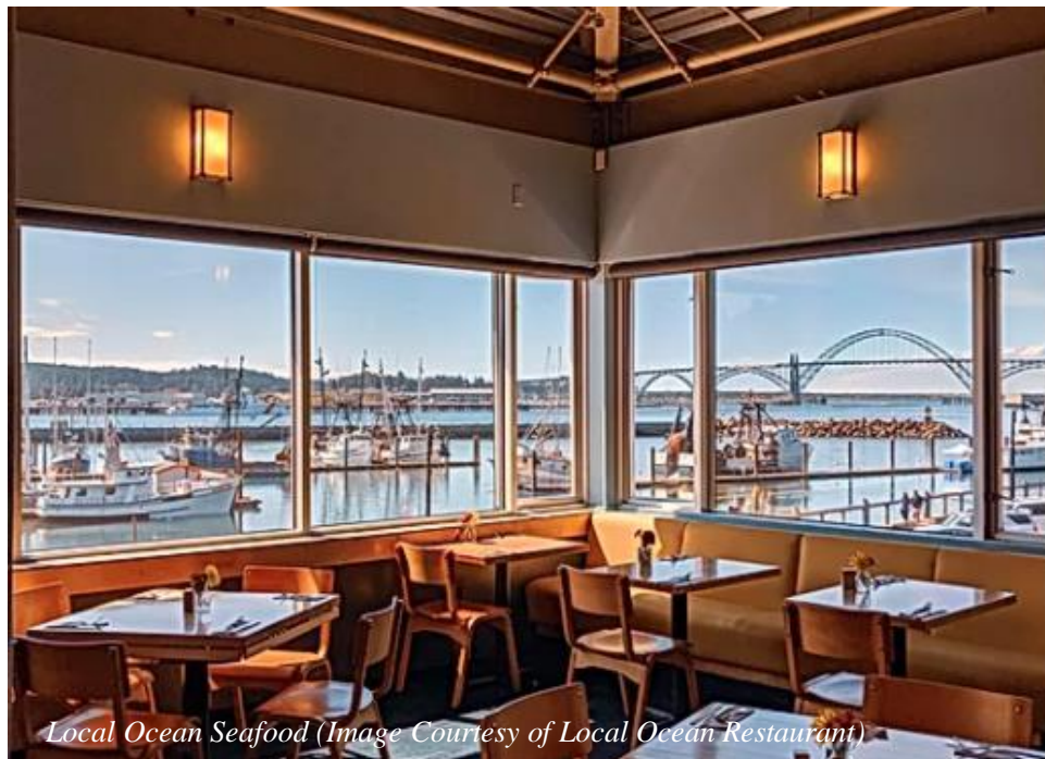
Local Ocean Seafood

Worthwhile Food and Drink in Neighboring Cities: Favorite spots include the Yachats Brewery, the Green Salmon (in Yachats), and M & P's Thai (in Lincoln City).