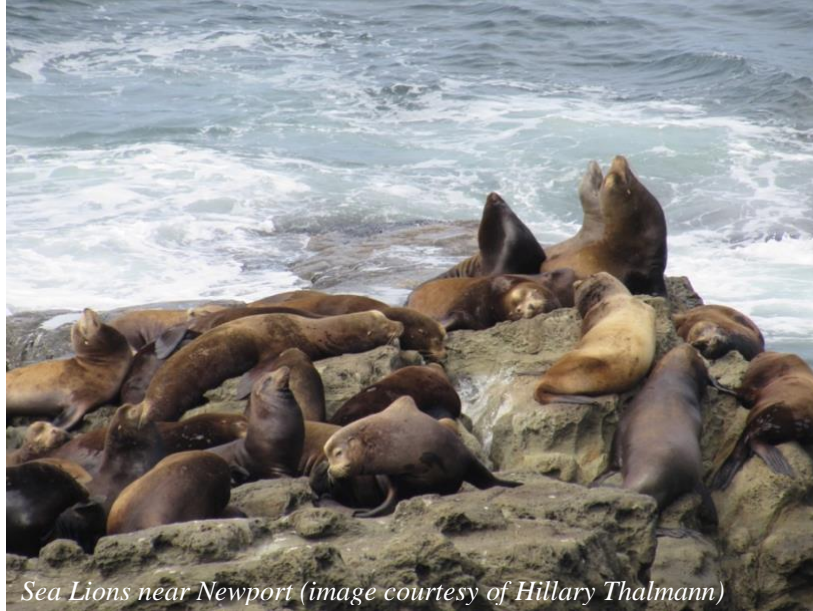
Sea Lions near Newport