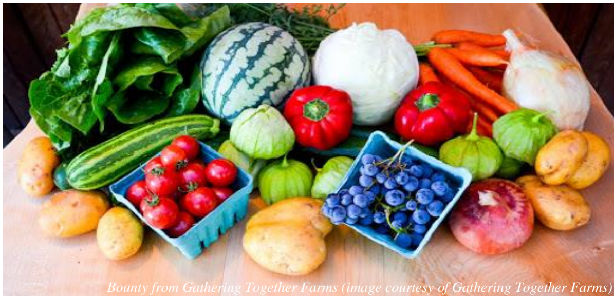
Bounty from Gathering Together Farms

----- This list was compiled by members of the Hatfield Marine Science Center Green Team. To learn more, visit https://hmsc.oregonstate.edu/green-team .